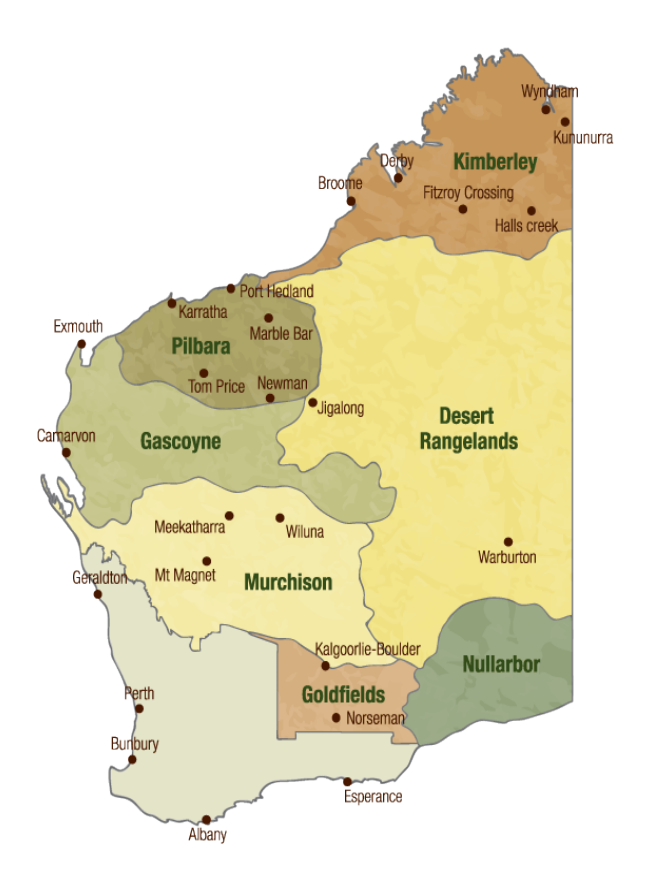
Figure 1: The WA rangelands

19 degrees of latitude and 16 degrees of longitude, the rangelands encompass a great diversity of climates, landforms and vegetation types ranging from wet-dry tropical savannas in the north, spinifex-dominated deserts in the arid interior, acacia and chenopod shrublands and mulga woodlands in the semi-arid interior and eucalypt woodlands and heathlands in the Mediterranean-type climates in the south. It also encompasses a diversity of land tenures and land uses, including mining tenements, pastoral leases, Aboriginal lands, conservation lands and unallocated crown land.